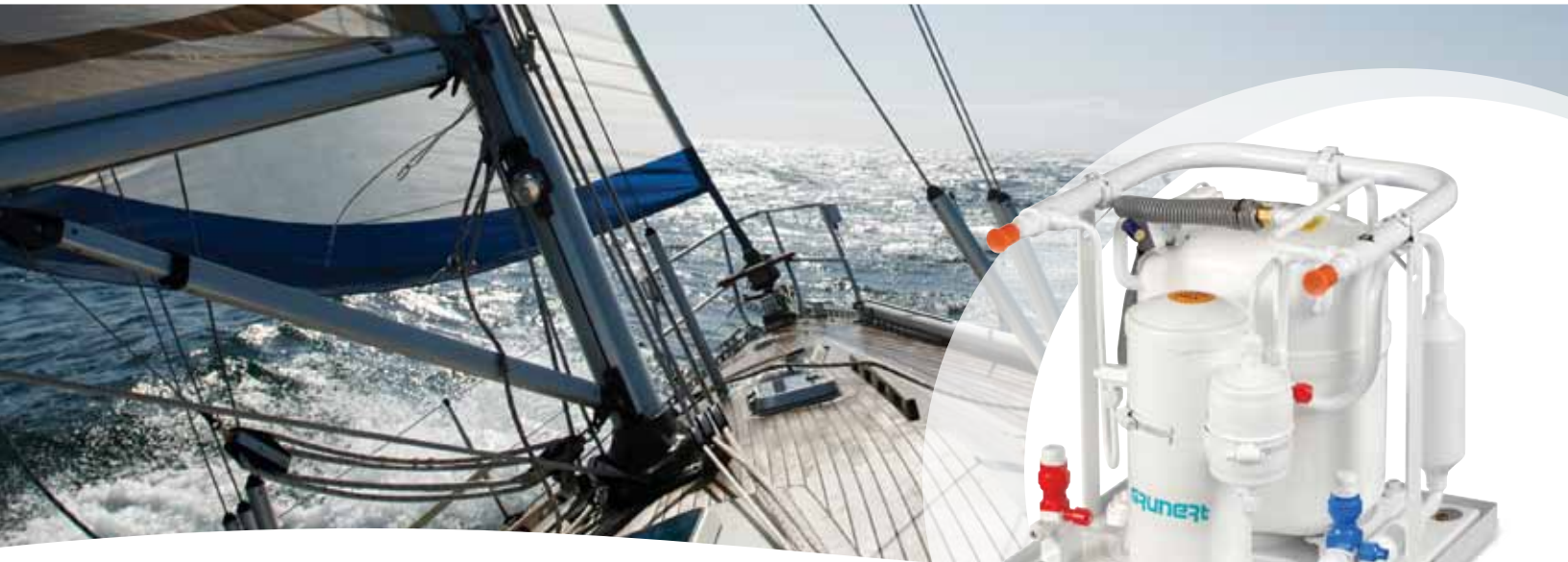
Passagemaker AC450 model shown

Grunert Passagemaker compressors are hermetically sealed for quiet, efficient operation. Vibration isolators are incorporated in all mounting platforms to provide additional noise reduction.