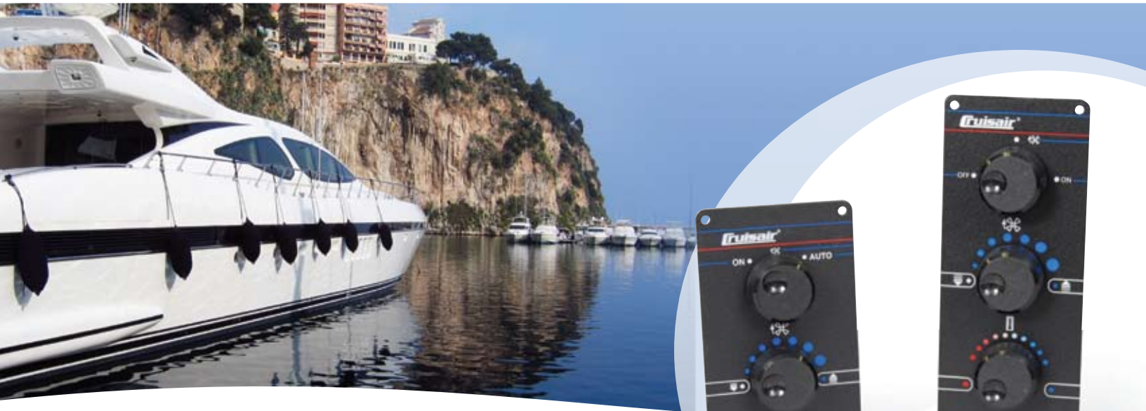
SA4A-ZB & SSA3-ZB shown

Cruisair electromechanical rotary-knob switch assemblies provide conventional control over basic air conditioning functions. Both 115V and 230V switches are available. The standard design is an aluminum plate covered with a modern black plastic overlay with text and graphical representations of the various functions. Many different configurations are available: