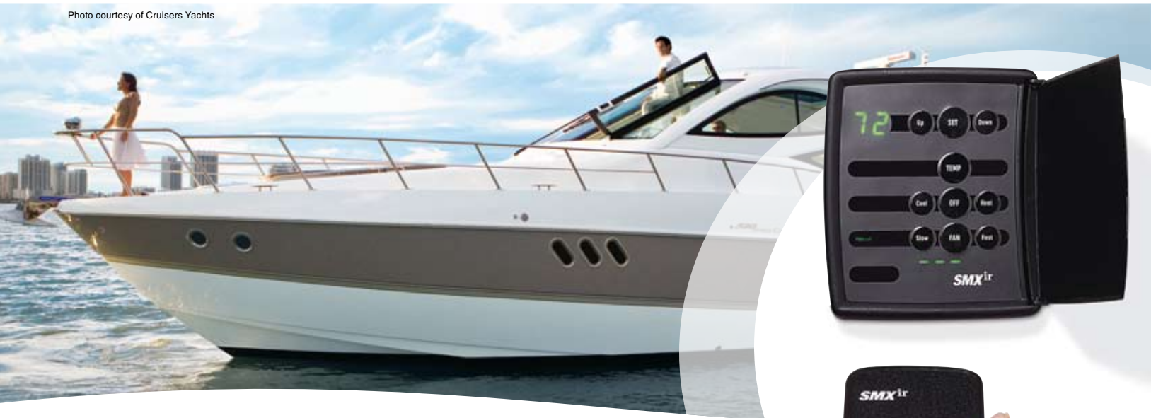
SMXir Keypad/Display with Remote Control