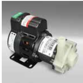
Air-cooled model AC-5CP- MD