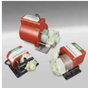
Liquid-cooled models (clockwise from top): LC- 5CP-MD, LC-3CP-MD, and LC-2CP-MD

Replacement parts for March pumps are available through Dometic.