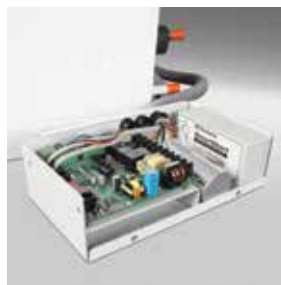
The electrical box has space for the optional SmartStart soft starter.