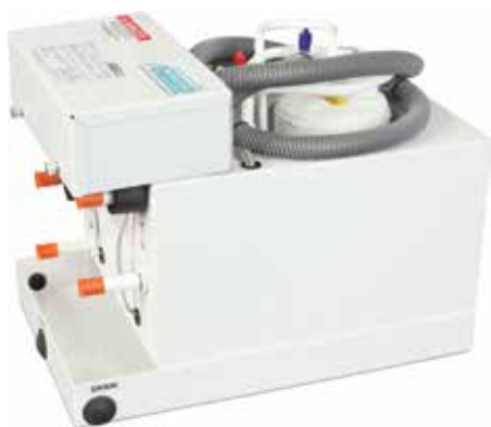
CHCG20Z shown with the electrical box mounted to the top (standard).

Marine Air's Chiller Compact series is ideal for larger boats in the 45-70 ft. (15-20 m) range. Available in capacities of 16,000 and 20,000 BTU/hr, the Chiller Compact uses circulated water in a closed loop in place of copper refrigerant tubes. The innovative, space-saving compact base of the Chiller Compact was designed to allow individual modules to be multiplexed to provide precise capacity requirements for any application.