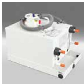
Extended drain pan collects and removes condensate that drips from water connections.