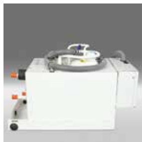
The electrical box can be mounted on the rear of the unit for better installation flexibility.

The electrical box comes installed on top of the unit. However, it has a short harness and hardware allowing the installer to easily move it to the rear of the unit if desired.