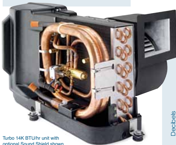
Turbo 14K BTU/hr unit with optional Sound Shield shown

Installation of the sound cover takes only minutes. All mounting hardware is included. The optional sound shields are available for all Turbo models, including the Cruisair Stowaway Turbo and the Marine Air Vector Turbo.