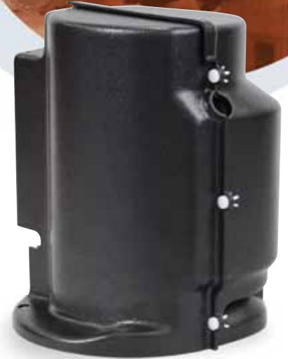
Turbo Sound Shield