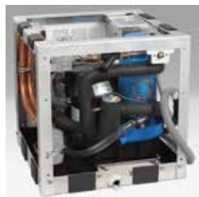
Ventilated cover panels can be removed for service access from any side.