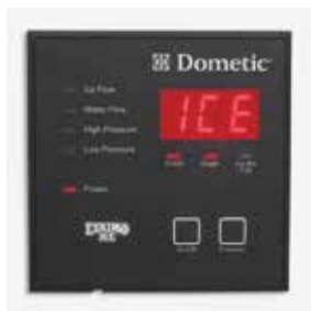
The easy-to-use Smart Logic digital control monitors all system functions.

— Kevin Stafford, captain, 60-ft. Buddy Davis