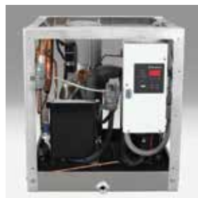
Ventilated cover panels can be removed for service access from any side.