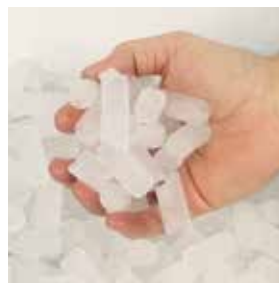
Special cylindrical ice shape maximizes ice density for greater cooling.