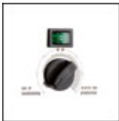
double function thermostat