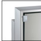
F1 version closeup