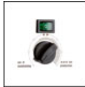
double function thermostat