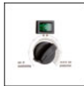
double function thermostat