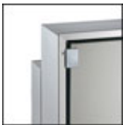
F1 version closeup