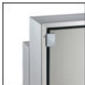
F2 version closeup