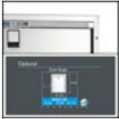
Flush flange and positive latch