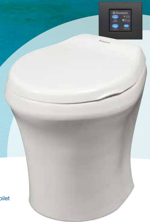
Model 4809 VacuFlush Toilet

SeaLand 4800 series all-ceramic VacuFlush® toilets bring water-efficient flushing to a new level. Boatowners can now choose between two flush modes to suit their personal preference or conserve resources – without sacrificing the powerful, bowl-clearing performance of a VacuFlush system.